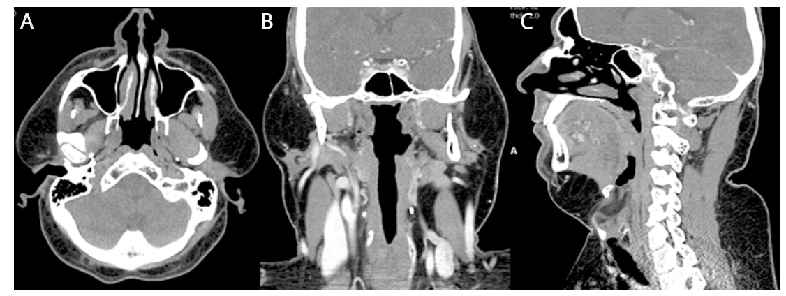
Figure 2 A-C. Head and neck CT showing the symmetrical enhancement of the lipomatous tissue

ty, Cushing's syndrome, angiolipoma, neurofibroma and liposarcoma [2, 4, 5]. The most effective treatment is surgery, especially in patients with esthetic deformity or compression of the aerodigestive tract [1, 3].